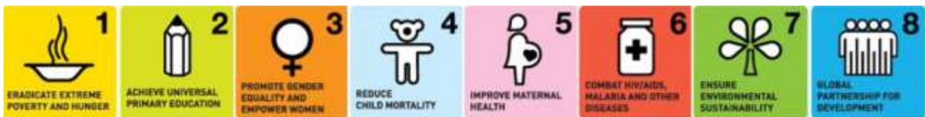
Fig. 2. The UN Millennium Development Goals (MDGs), to be realized by September 2015.